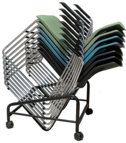
3080Dolly: Holds up to 15 Model 3080 and 3081 chairs