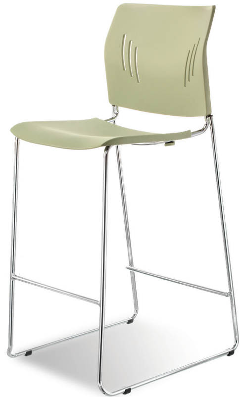
Model No. 3085 Tela Stool