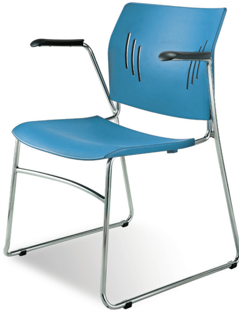
Model No. 3081 Tela Guest Chair With Arms